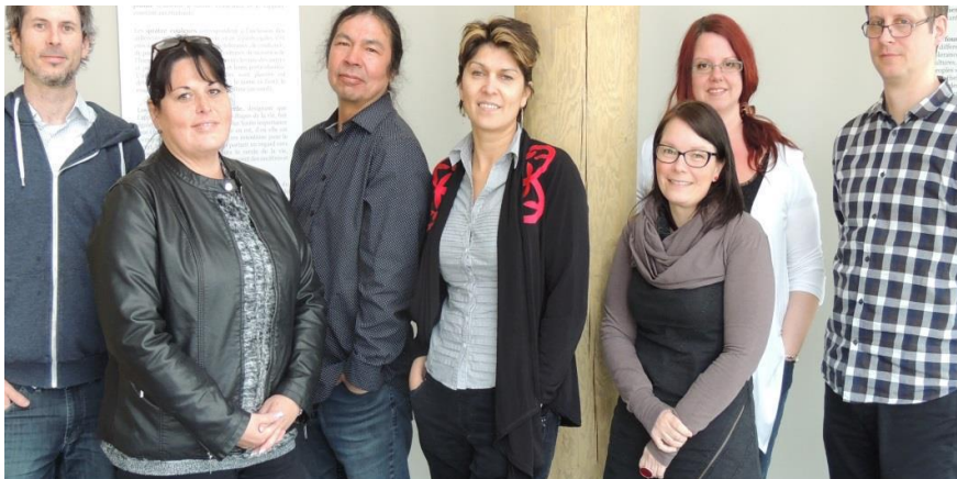
CAQS Report on Student Roundtables. Imagining Canada's Future – October 2

This situation makes it difficult for young aboriginals to develop interest in work that could be important to the future of the communities.