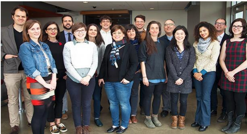
CONCORDIA PANEL PARTICIPANTS

The majority of discussants at Concordia's session on this question were Canadians who also hold citizenship in a different country of origin. That scenario played itself out in sessions at several other institutions as well – a testimony to the relevance of this question – and to the changes that have occurred here. It is not surprising then that a common observation at these sessions was, as McGill puts it: “looking into the future requires a healthy dose of introspection.” Or as Concordia states: “Canada needs a reality check of who we are and what we want our global role to be.” A common theme echoed in these discussions: for Canada to thrive in the 21st century, we require deep understanding of our own population, including how various communities integrate within our society, and of the languages, cultures, histories, economic impacts, and integration of our own and global populations.